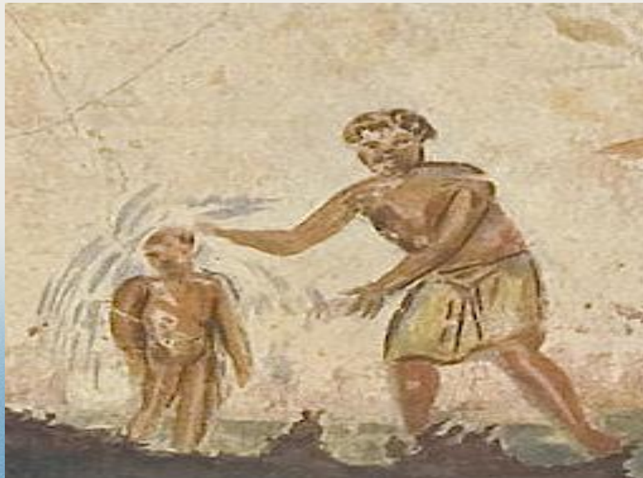
Early Depiction of Baptism in the Catacombs of San Callisto in Rome