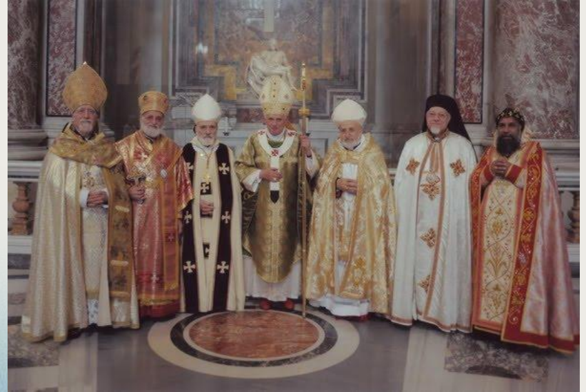
Pope Benedict XVI Meeting with Patriarchs of Eastern Rites