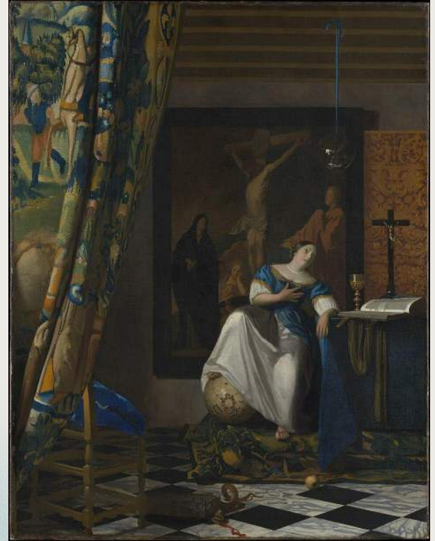
Vermeer's Allegory for the Catholic Faith c. 1670 AD